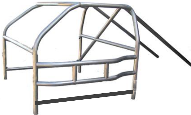
The "BASIC" ChumpCar Roll-Cage

3.2. Roll-cages and Supporting Structure: A quality, well-fabricated, full roll-cage is required. Roll-cages may be weld-in or bolt-in; roll-cage tubing joints may be welded or bolted, provided bolt-in methods meet conventional safety standards. Vehicles with a poorly built, improperly mounted, inadequately fitted or badly engineered roll-cage will NOT be allowed to compete.