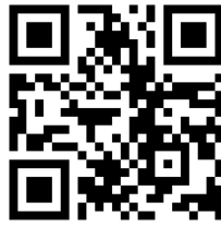
Event Driver & Crew Meeting

Download and read the ChampCar Endurance Series BCCR: