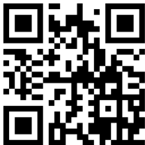
New To ChampCar Meeting