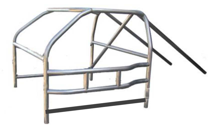
The "BASIC" ChumpCar Roll-Cage

For full and complete details on basic roll-cage design, materials and approved installation, see Section 3 of the 2012 ChumpCar Rules – Appendices.